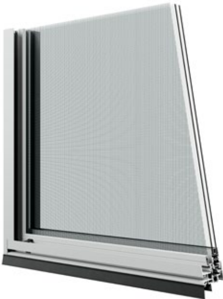
Aluminium screen fixed externally