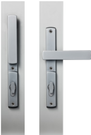
Infinity window handle