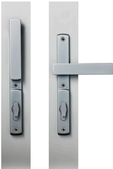
Infinity window handle